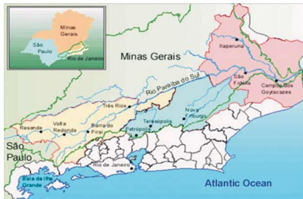
Figure 1 - Rio de Janeiro State and Paraíba do Sul river basin (UNDP, 1999, in Faria, 2002).

With the development of this technique, the scoring of the parameters introduced in the IQS was successfully achieved as shown in Table 6.